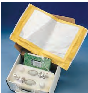
Qualitative Test Kit