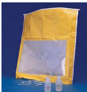
Replacement Hood and Test Solutions