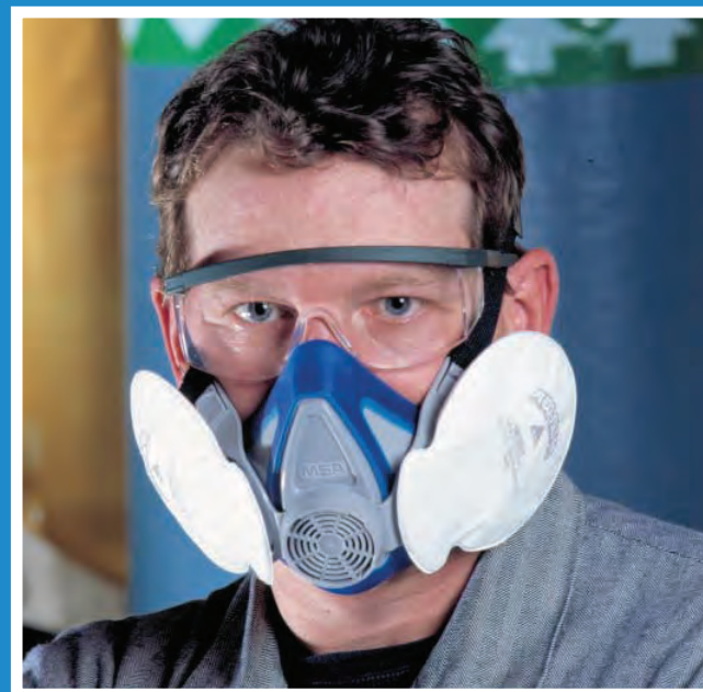
The 200 LS integrates well with other PPE

Donning the mask is made easier with MSA's new pre-adjustable straps. With the Advantage 3200 Respirator, you can position the upper straps for a consistent fit and minimal adjustment, time after time. The pre-set upper straps prevent uncomfortable snags during donning and doffing, and also provide a tighter, more secure seal. Wearers also have the option of the new European-style Advantage harness, which dons like a catcher's mask.